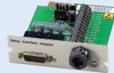
Relay Interface Card

Interwork with your existing Building Management System. A Modbus® Card enables real-time monitoring of UPS systems through a building management system or industrial automation system.