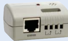
Environmental Monitoring Probe

Independently manage diverse servers. A Multi-server Card enables up to six serially connected devices of mixed operating systems to be independently managed and controlled by a single UPS.