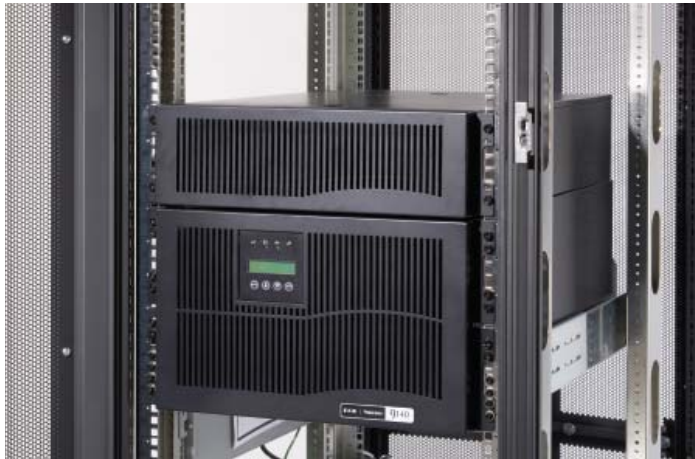
The 9140 and one EBM occupy only 9U of rack space.