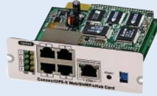
ConnectUPS Web/SNMP Card

The standard unit is equipped with USB and RS-232 serial ports to communicate with power management software. You can customize your UPS by adding an interface card for other applications: