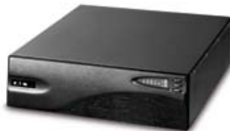
5125 rackmount 5000 to 6000 VA