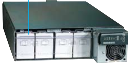
5000/6000 VA rackmount model

Hot-swappable electronic modules - replace electronics modules without shutting down connected equipment (available on 5000 VA to 6000 VA models)