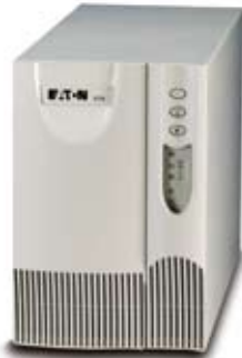
5125 tower model 1000 to 2200 VA